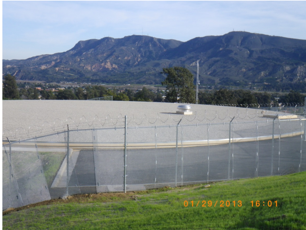
Gooding Reservoir Completed in 2013